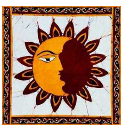
Ancient Indonesian batik

practised in China as early as the Sui Dynasty (AD 581-618). These were silk batiks and these have also been discovered in Nara, Japan in the form of screens and ascribed to the Nara period (AD 710-794). It is probable that these were made by Chinese artists. They are decorated with trees, animals, flute players, hunting scenes and stylised mountains. Indonesia, most particularly the island of Java, is the area where batik has reached the greatest peak of accomplishment. The Dutch brought Indonesian craftsmen to teach the craft to Dutch warders in several factories in Holland from 1835. With this method colour is introduced into fabric. Portions of the cloth, covered with wax resist the dyes. When the dyeing process is complete the wax is removed by heat. Batik is still used all over the world. Different books on batik can be found on the market.