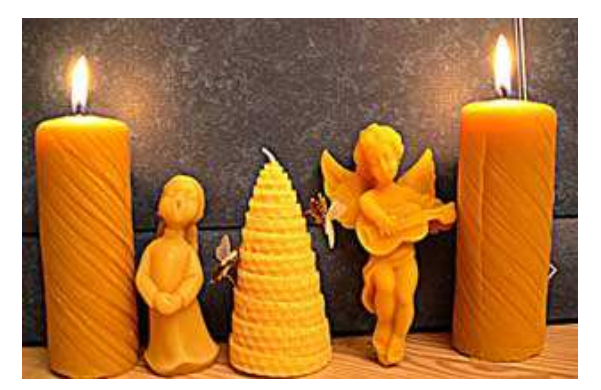
molded beeswax figures with a rolled candle in the middle and molded candles on the sides