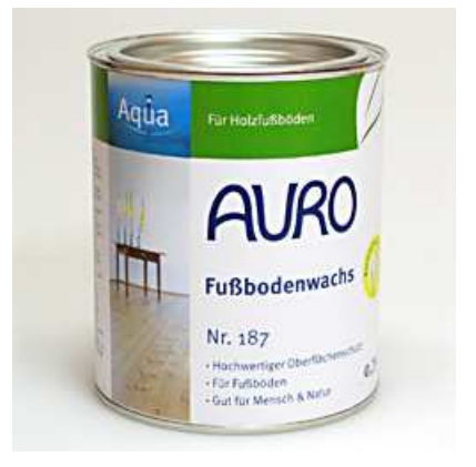
Beeswax floor furnish