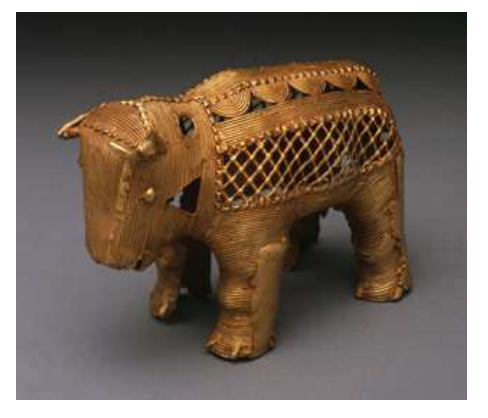
Africa, 17 C