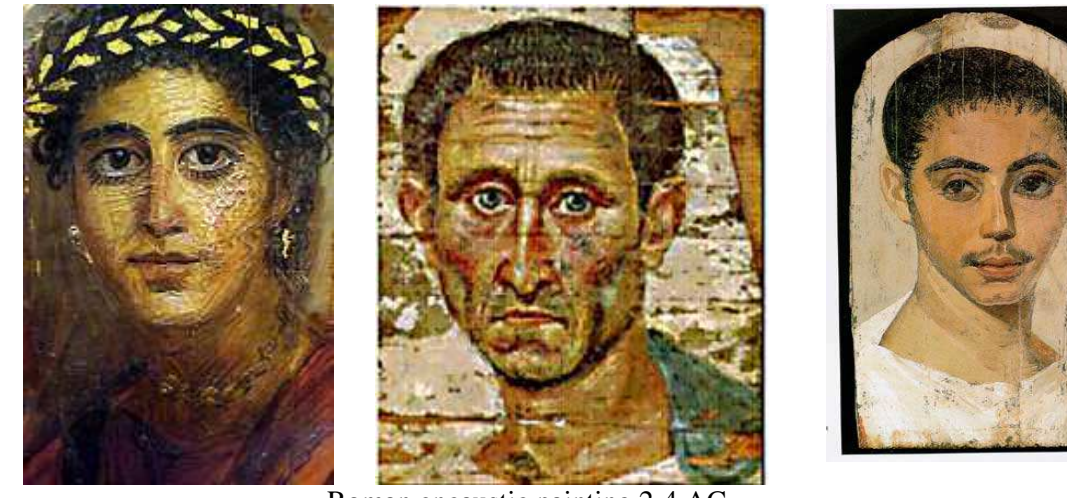
Roman encaustic painting 2-4 AC

Further reading: <sup>14, 18, 21, 22, 26</sup>