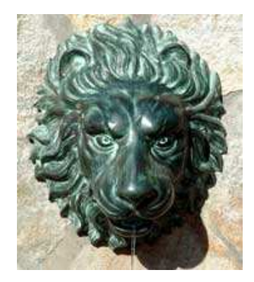
Fountain lion, old Italy