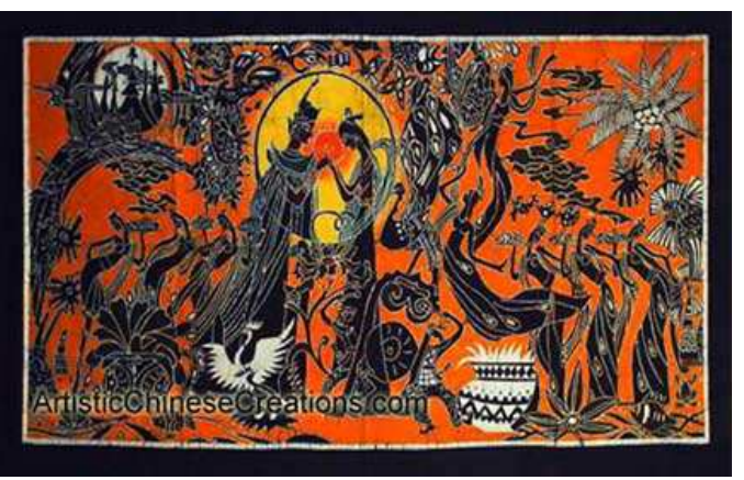
Ancient Chinese batik