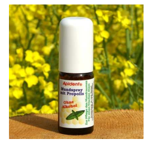
Propolis oral spray without alcohol