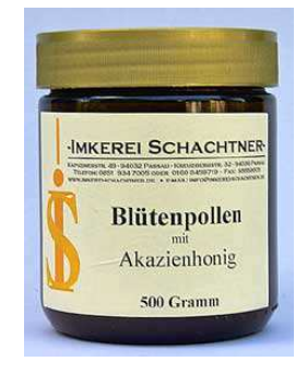
Pollen in honey combines the functional properties of the two products.