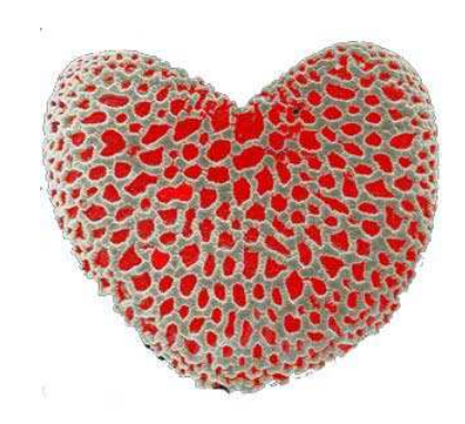
tiger lilly pollen, courtesy www.pbrc.hawaii.edu

The old Egyptians describe pollen as "a life-giving dust." Pollen and its nutritional value is still surrounded by mysteries. It is called the only perfectly complete food. The consumption of plant producing seed, the pollen, is praised in the Bible, Genesis 1:29: And God said, See, I have given you every plant producing seed, on the face of all the earth, and every tree which has fruit producing seed: they will be for your food.