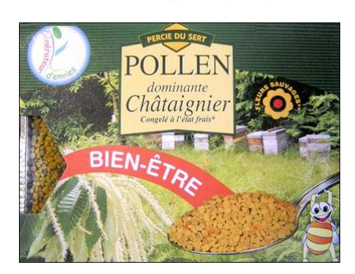
Fresh frozen pollen conserves best the biological properties of pollen

Pollen intake can improve gut, gastroenterological and liver health