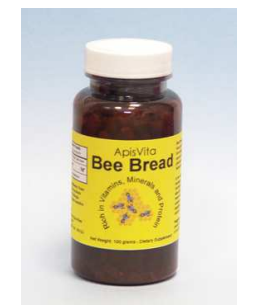
Bee bread for optimal digestibility and bioavailability of pollen ingredients