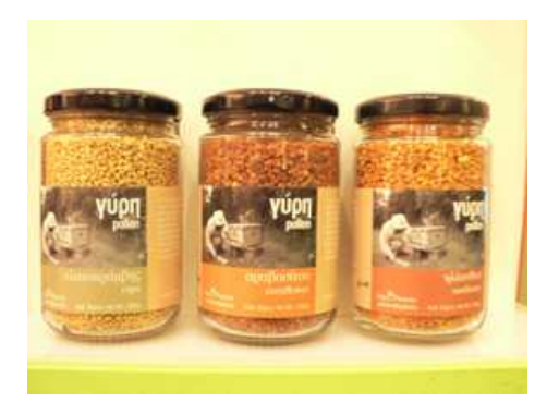
Harvesting of unifloral pollen ensures constant and reproducible concentration of biologically active ingredients.