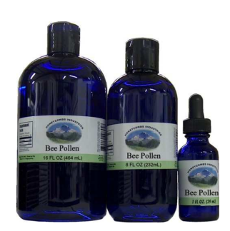
Pollen extracts or tablets are used for intake of easily digestible pollen component supplementation.