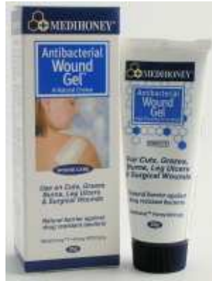
Antibacterial wound gel