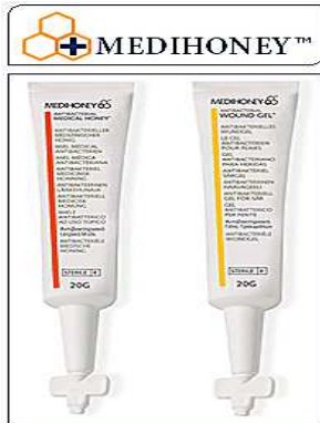
Medihoney for wound care