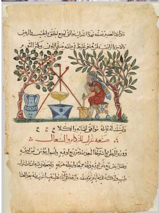
Preparation of honey medicine from Materia Medica, Dioscorides, Arab translation 1224

Today the knowledge on the healing virtues of honey and the other bee product is called apitherapy is compiled in many books or on the Internet www.apitherapy.com , www.apitherapy.org