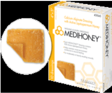
Medihoney wound gauze