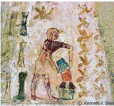
Pabasa tombs, 26th Dynasty, 760-656 BC