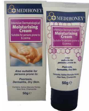
Moistering cream against eczemas